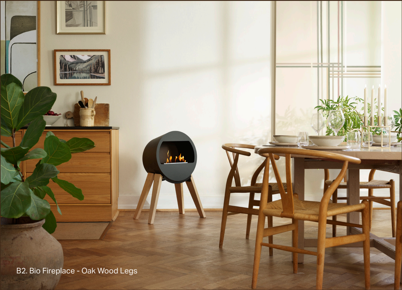
B2. Bio Fireplace - Oak Wood Legs