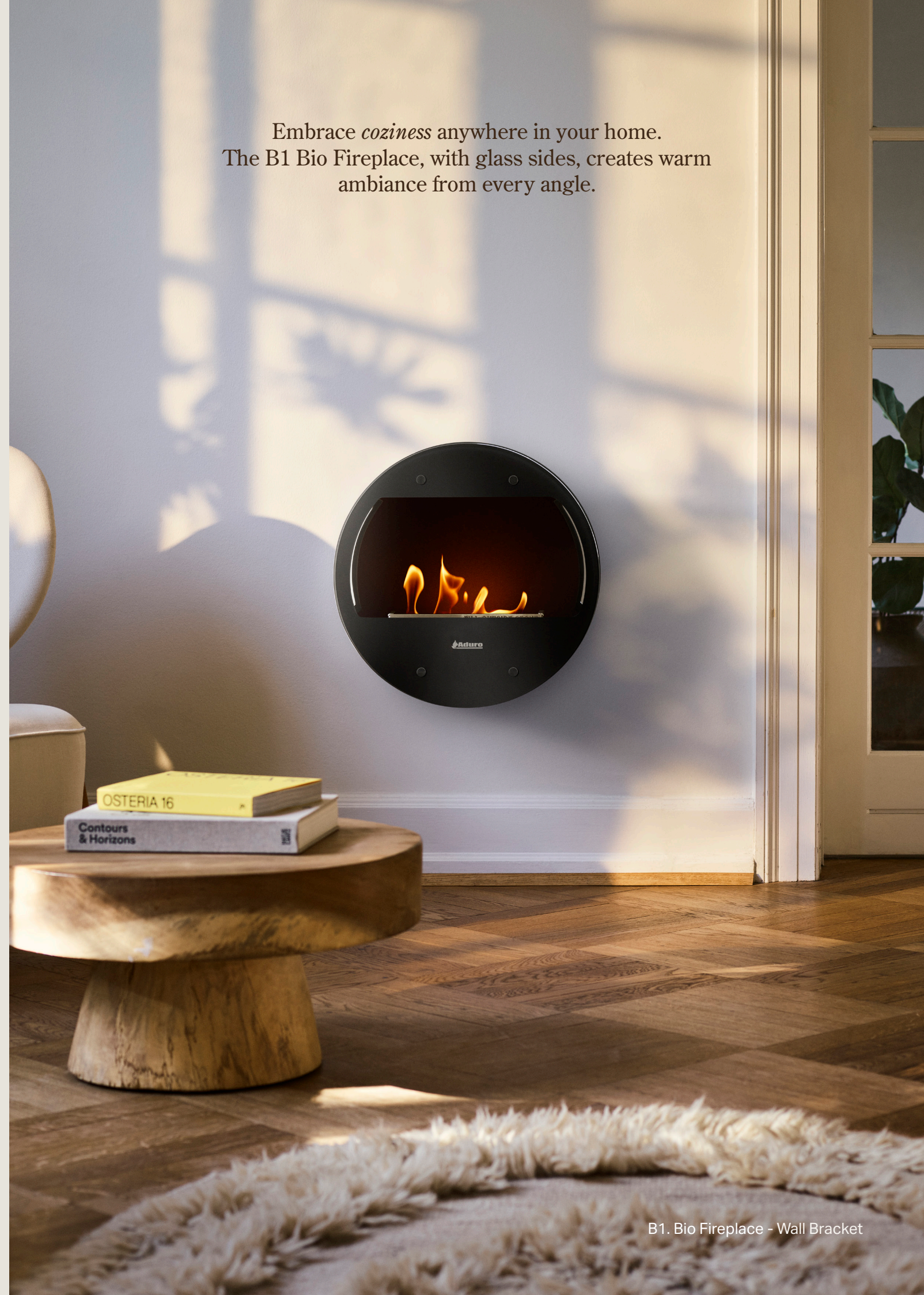
B1. Bio Fireplace - Wall Bracket

Embrace coziness anywhere in your home. The B1 Bio Fireplace, with glass sides, creates warm ambiance from every angle.