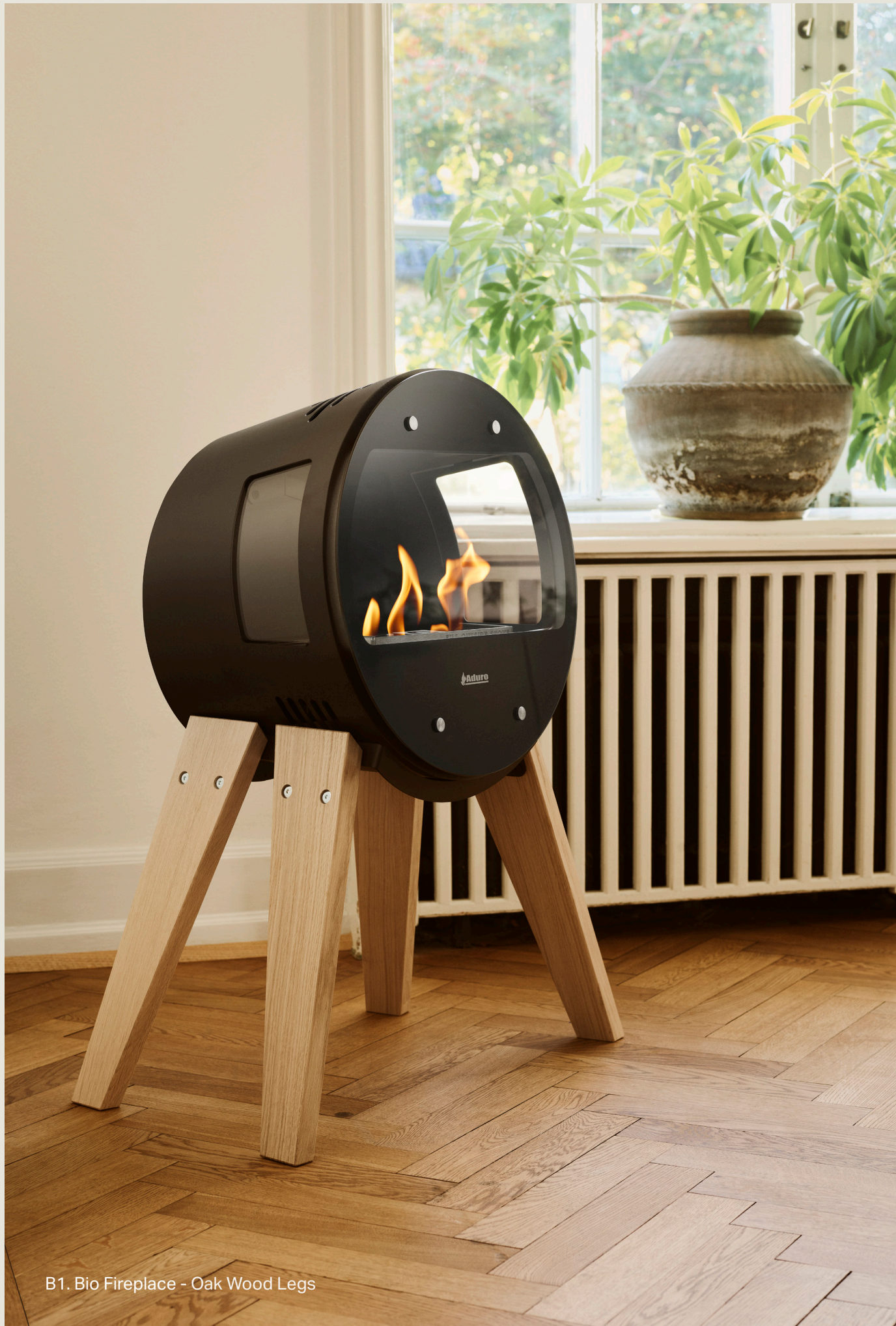
B1. Bio Fireplace - Oak Wood Legs