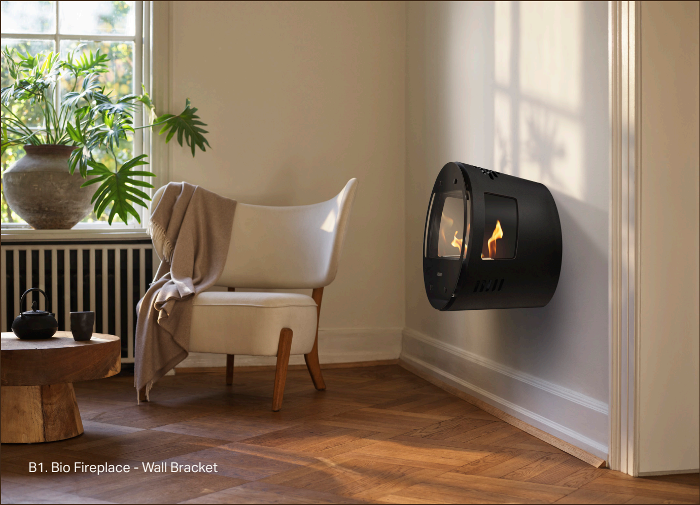
B1. Bio Fireplace - Wall Bracket