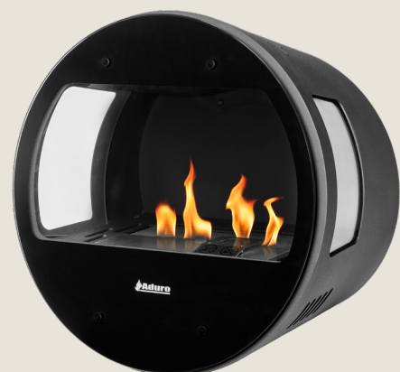
Oak Wood Legs